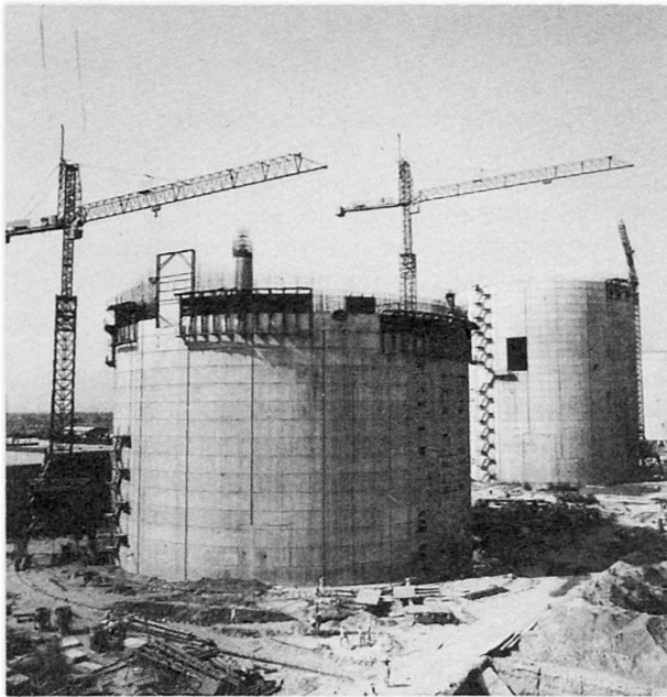
Fig 2 General view showing construction of containment walls