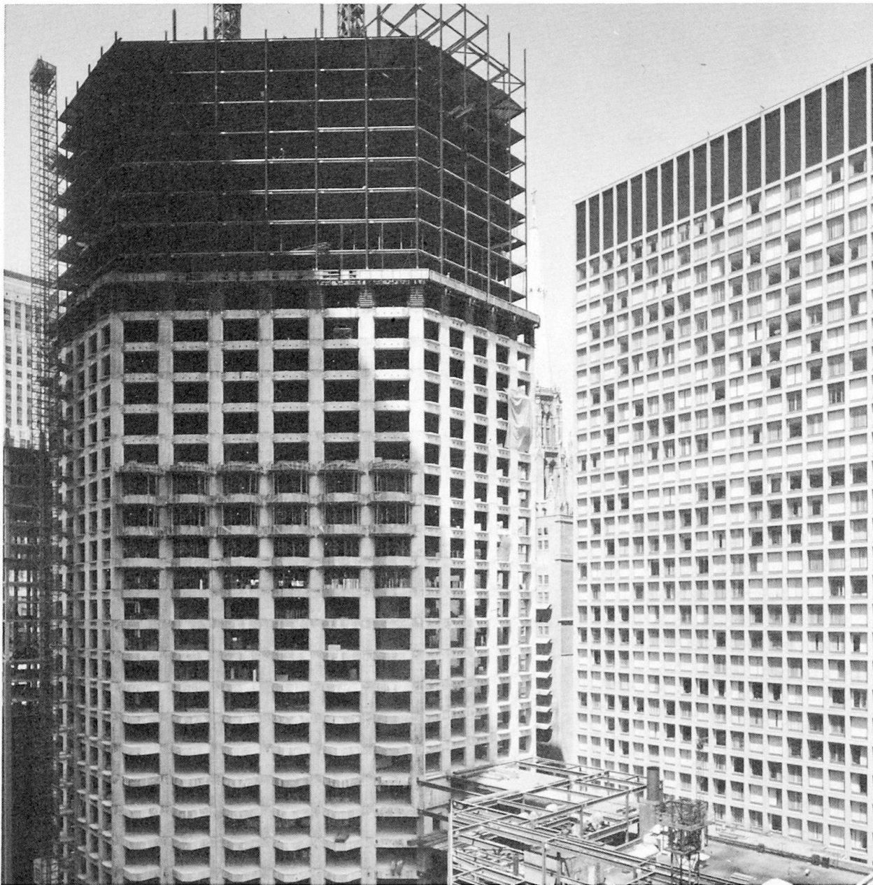
Fig. 3 Tower under Construction