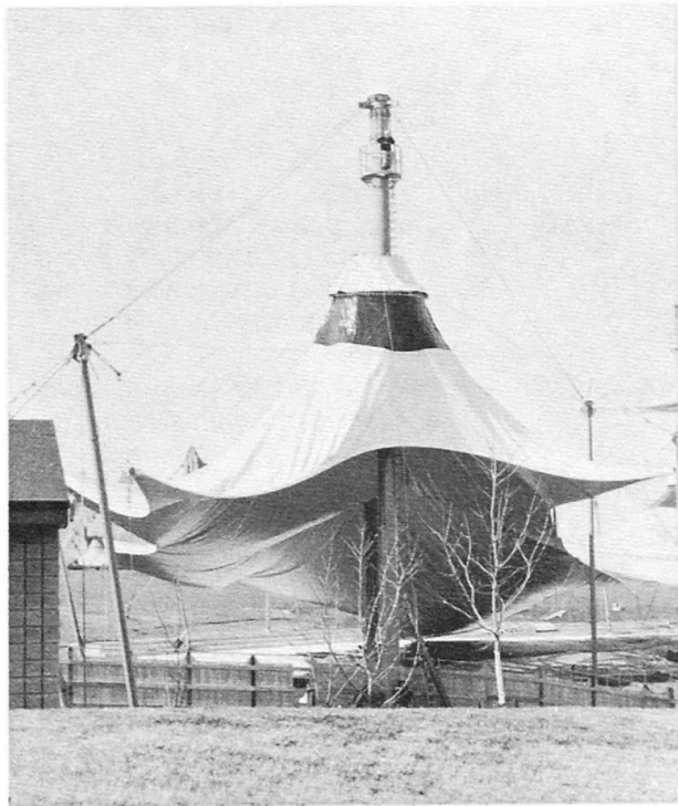
Fig. 4 Raising membrane