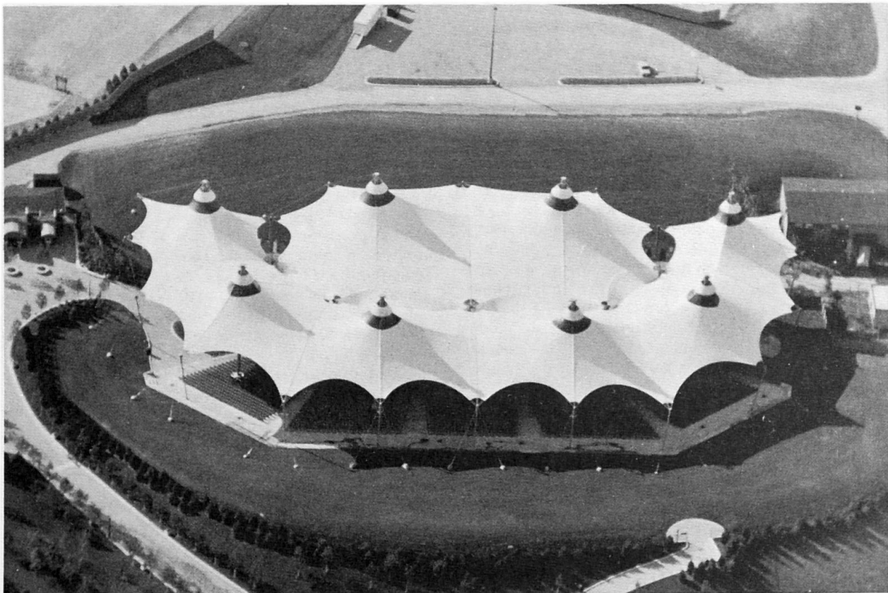
Fig. 3 Areal view