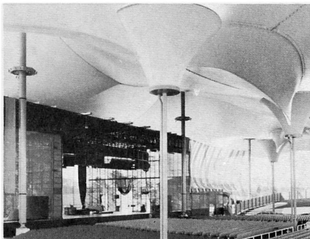
Fig. 1 View of performance area

The traditional method of resisting guy cable tension has been the use of mass concrete anchor blocks. At Kingswood the large number of anchors and the high magnitude of the forces would have made the use of mass concrete footings very expensive. The dense glacial till, which underlies the site, provided an excellent opportunity to use battered belled caissons to mobilize soil weight and resist tension forces. This system used approximately 1/6 of the concrete volume that would have been used for mass footings at 1/3 the cost (Fig. 2). A total of approximately 200 m 3 of concrete was used for the tent foundations.