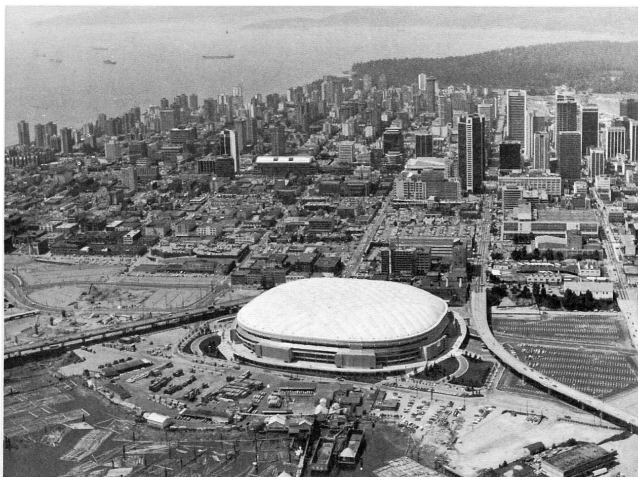
Fig. 1 Stadium at B.C. Place

Soil conditions were favourable, with good glacial till near the surface over most of the site. All foundations are spread footings, with only one minor exception. Allowable bearing pressure was 380 kN/m 2 . This structure is in seismic Zone 3. The light weight of the roof was a major factor in reducing the cost of seismic resistance.