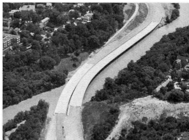
Fig. 1 Aerial plan

All piers consist of 3 m round columns averaging 4 m in height with post-tensioned pier caps. Circular piers were chosen to minimize the effect on creek flow which was a concern of the nearby generating station. Associated with the project were 305 m of retaining walls the majority of which were designed and constructed using the reinforced earth technique.