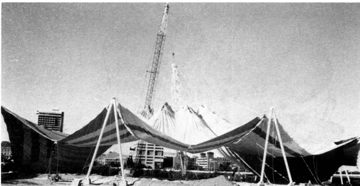
Fig. 3 Raising the membrane for one of the structures