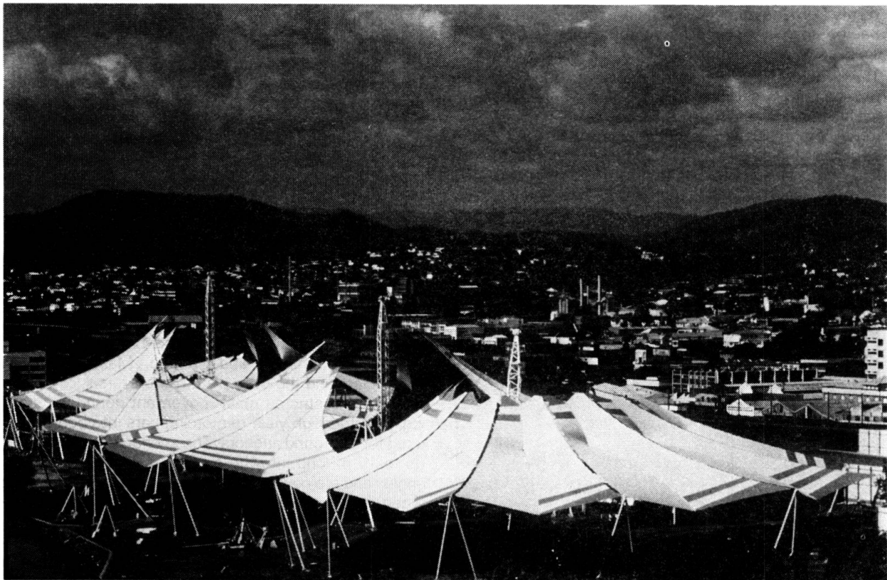
Fig. 1 Overall view of the shade structures

The structures are supported on 5 masts (3 of which are inclined) 30 to 50 metres high. At the perimeter inclined tubular bi-pods, tri-pods and X-shaped pods support the membrane at a height of approximately 15 metres. From the mast heads steel cables, with sockets and fittings to accomodate for tolerances and stressing requirements, span to the perimeter supports. Tiedown cables with pulling points on the membrane are fixed to aerial points or to nodes close to the mast. The membrane consists of a PVC-coated polyester fabric Type IV Tensile strength 150 kN/metre in both directions.