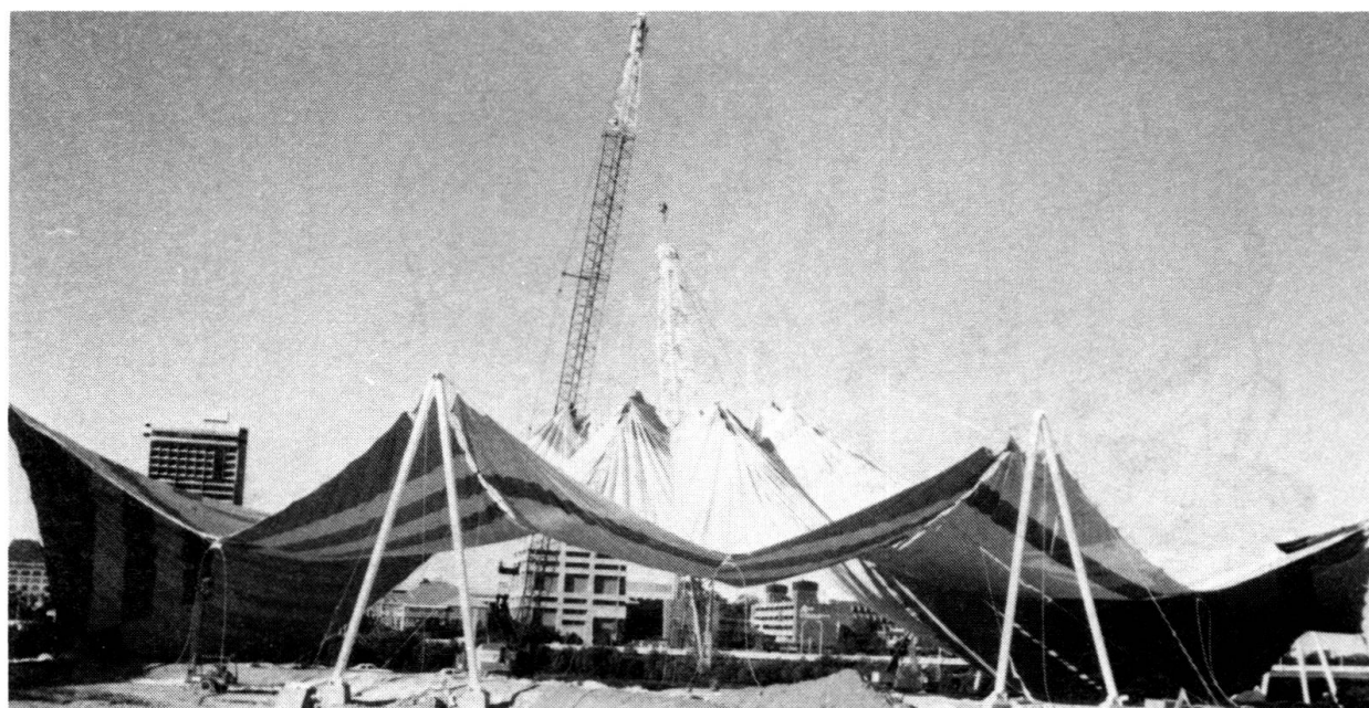
Fig. 3 Raising the membrane for one of the structures