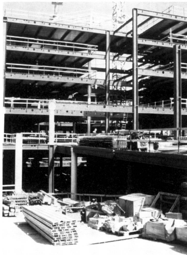
Fig. 4 Steel frame