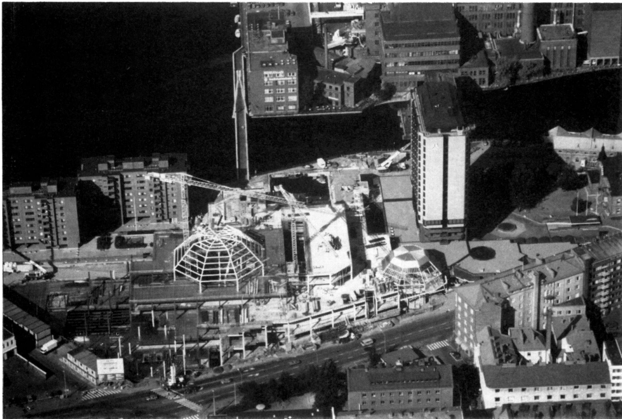
Fig. 3 Air photograph