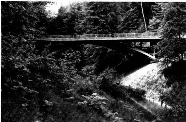
Canal Bridge at Frederiksværk.

The reinforced concrete bridge in question is an arch bridge 45 m long, 13.5 m wide, built in 1950 and designed by Cowiconsult. Above the 27.5 m span of the arch itself, the bridge deck is divided into sections. At either end of the arch there is a 7 m bay.