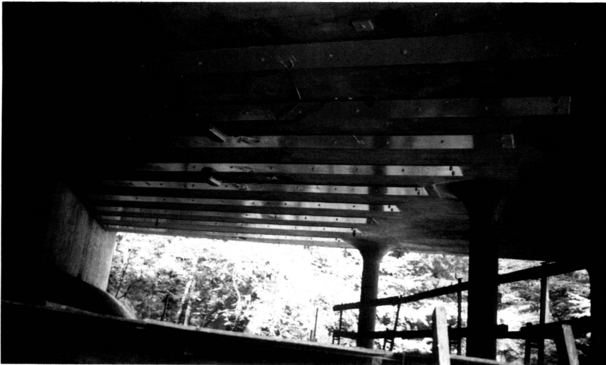
Bridge deck reinforced with bonded steel plates. The strain gauges were used to verify the efficiency of the bonding. The bolts are removed after completion.