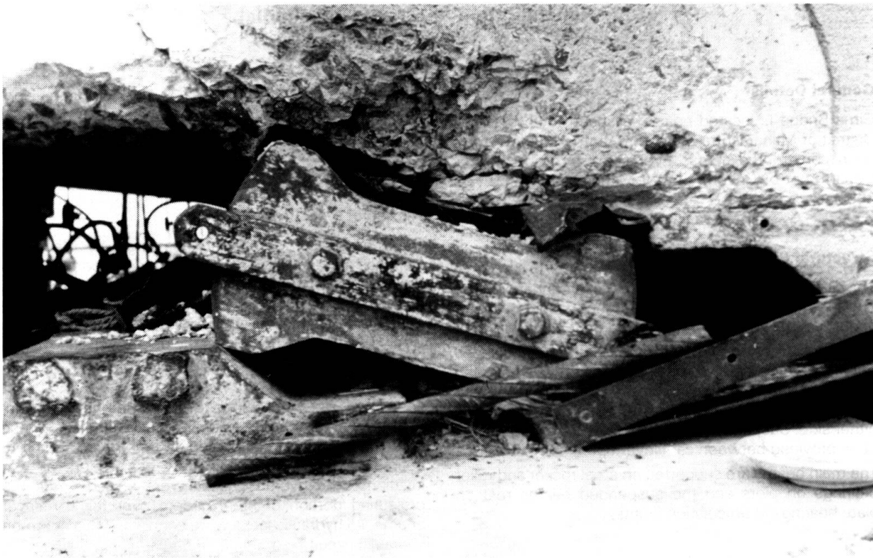
Fig. 2 Position of segmental roller bearings

The well cap was also strengthened. Six numbers steel supports were erected from the well cap for lifting of the box girder. Each box girder was provided with two lifting points, one on either side of the pier. The large diameter Hydraulic Jacks of 200 tonnes capacity with safety nut arrangement were used for lifting the weight of 800 tonnes. In addition to the jacks stand-by support points were provided. Steel packing was provided over these support points continuously during lifting operation.