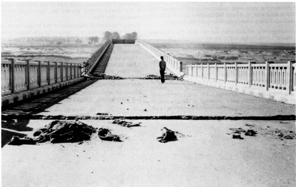
Fig. 1 Top view

It was decided to restore the bridge, as similar floods were not anticipated for a long period. Boulders in steel wire crates were dumped in the form of flexible garland around the affected well No. 3 to increase its stability and reduce the chances of further scour of bed. The pier was strengthened by concrete jacketing, so that it could withstand the loading in tilted position of well and pier.