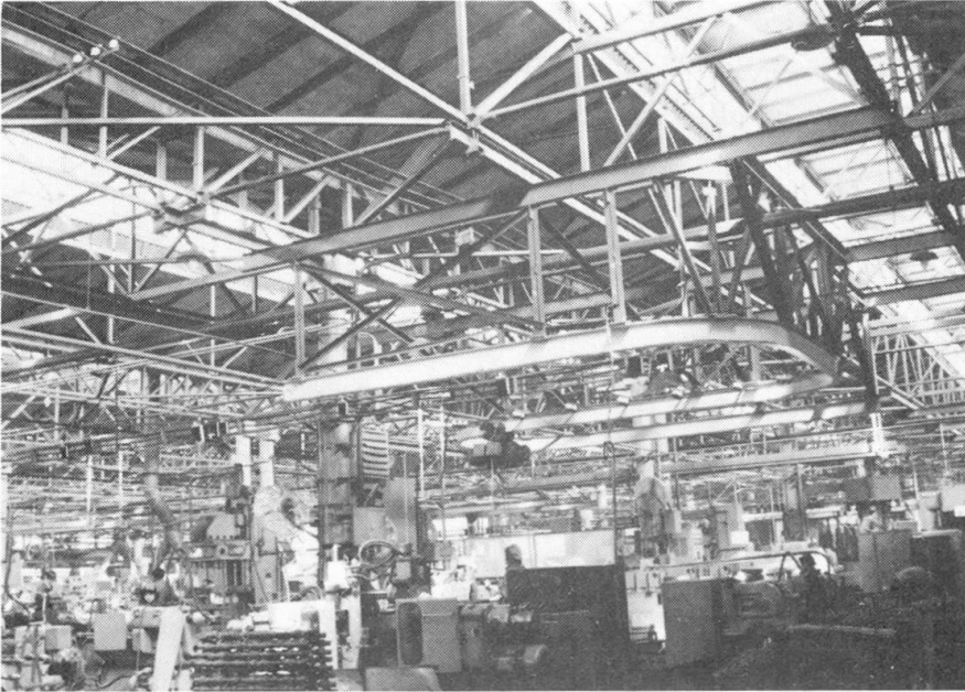
Fig. 3 roof trusses with hanging-crane

In recent years, the use of profiled steel sheetings has been increasing gradually in building constructions. According to incomplete statistics, the buildings using these materials as roof decks and wall panels have far exceeded 1,000,000m 2 up to now, among these are Shanghai Baoshan Iron and Steel General Plant, Shanxi Shentou Power Station, Shenzhen Dock Warehouse and Guangzhou Container Plant, etc.