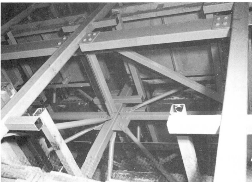
Fig. 4 rack structure