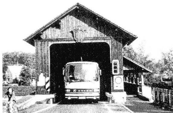
Fig. 3: Bridge Luzern