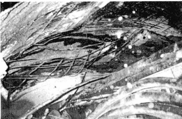
Great Belt Tunnel after a fire during construction.

The effects and the costs etc. of all risk reducing measures must be established and used in the evaluation of the most suited set of measures.