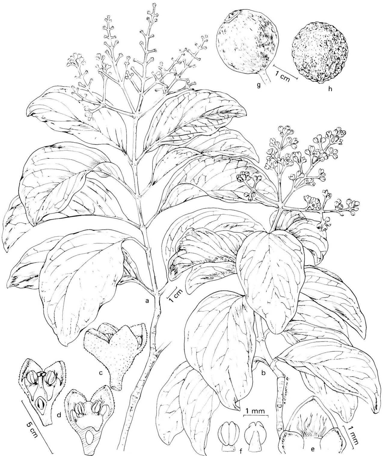
Fig. 3. — Santalum insulare var. deckeri var. nov. (from Sachet 2113 , type).

a-b , habit; c , flower; d , longitudinal sections; e , inner face of perianth part showing hairs and disc lobes; f , stamen; g , fruit; h , stony endocarp.