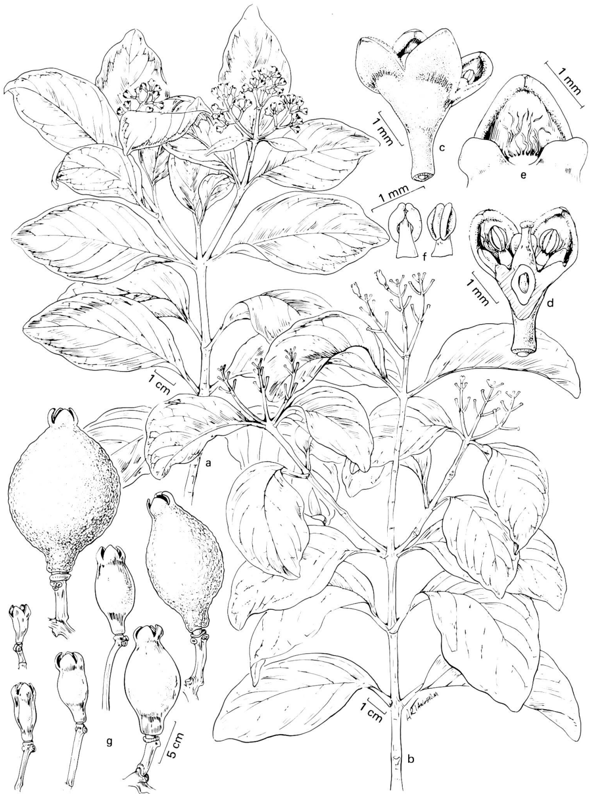
Fig. 2. — Santalum insulare var. marchionense

a , habit, with flowers (from Schäfer 5149); b-g , habit with very young fruit, and details (from Decker 1246): c , flower; d , longitudinal section; e , inner face of perianth part with hairs and disc lobes; f , stamen; g , stages in the development of the fruit, including fully developed one.