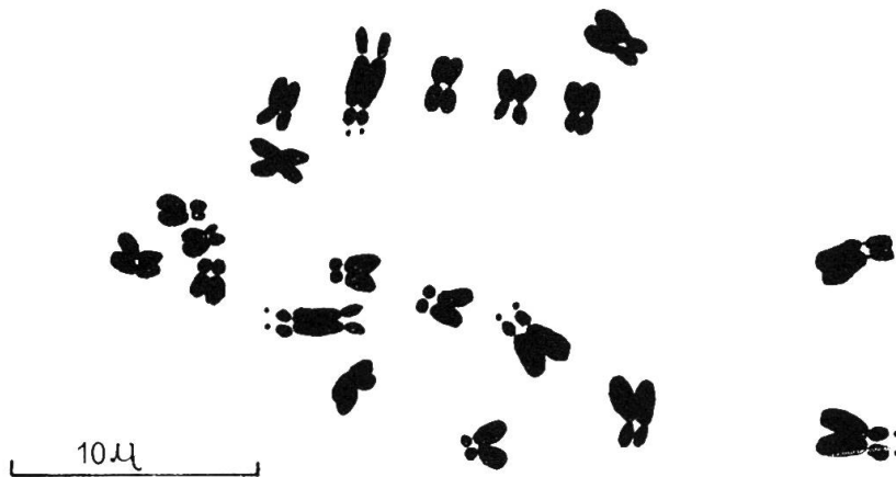
Fig. 2. — Mitotic chromosome plate of Cremnophyton lanfrancoi .

vegetation must be referred to Triadenio-Chiliadenetum bocconeii , a rupestrian association described by BRULLO & MARCENO (1979), which is endemic of the Maltese Archipelago.