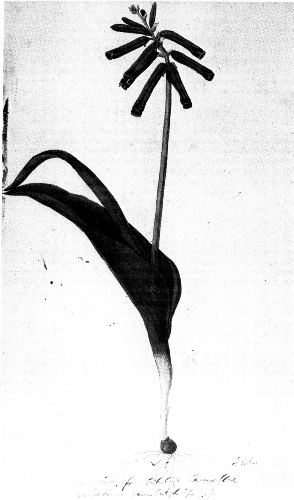
Fig. 1. — The lectotype of Aletris bifolia N. L. Burman, Courtesy University Library, Utrecht.