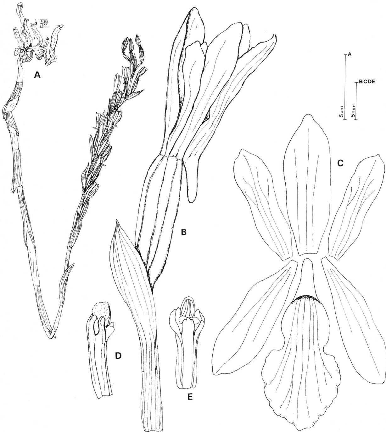
Fig. 1. — Limodorum brulloi Bartolo & Pulvirenti A, habit; B, flower and bract; C, flower pieces; D, gynostegium lateral view; E, gynostegium frontal view.