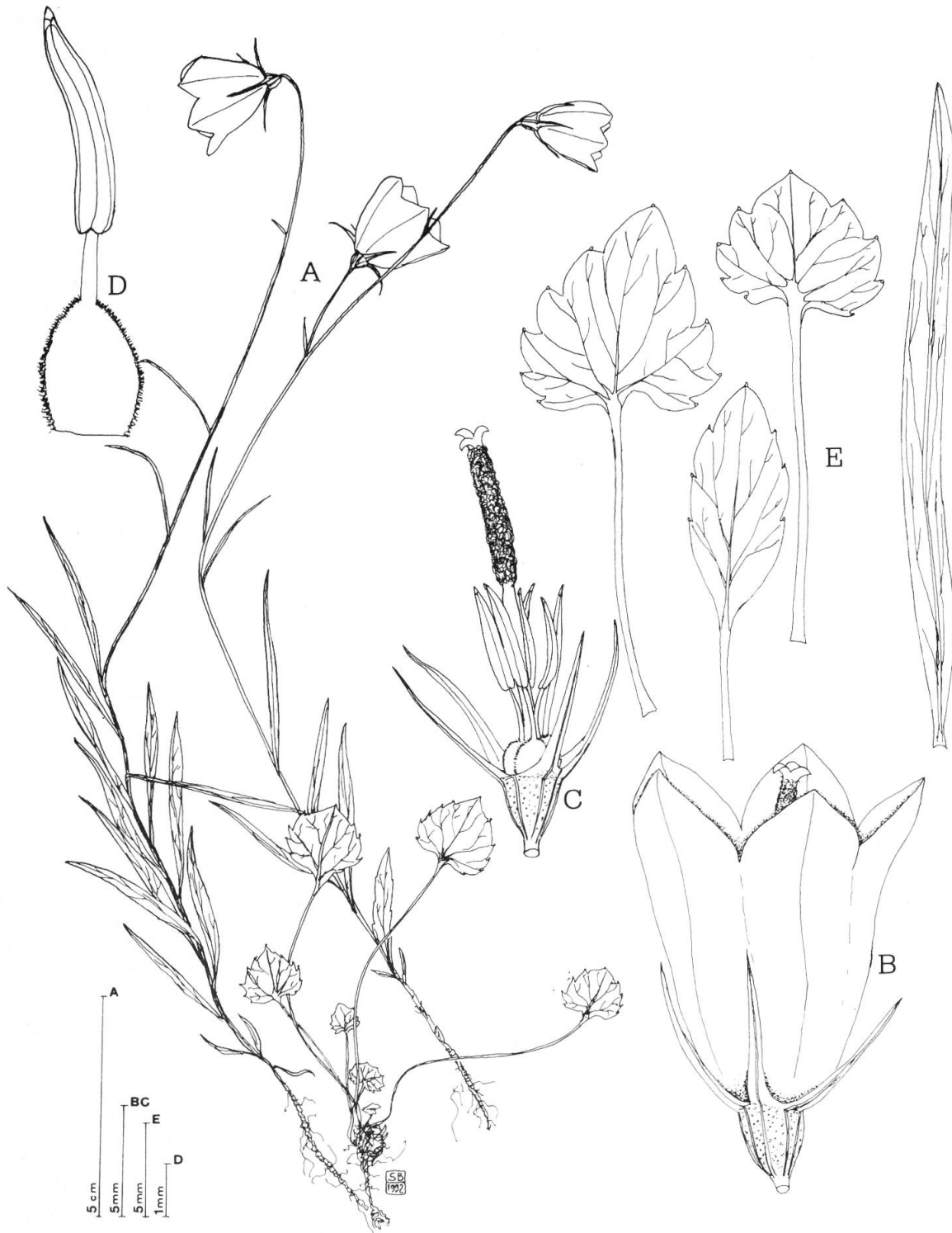
Fig. 2. — Campanula pollinensis Podl. (from M. Pollino). A, habit; B, flower; C, flower without corolla; D, stamen; E, leaves.