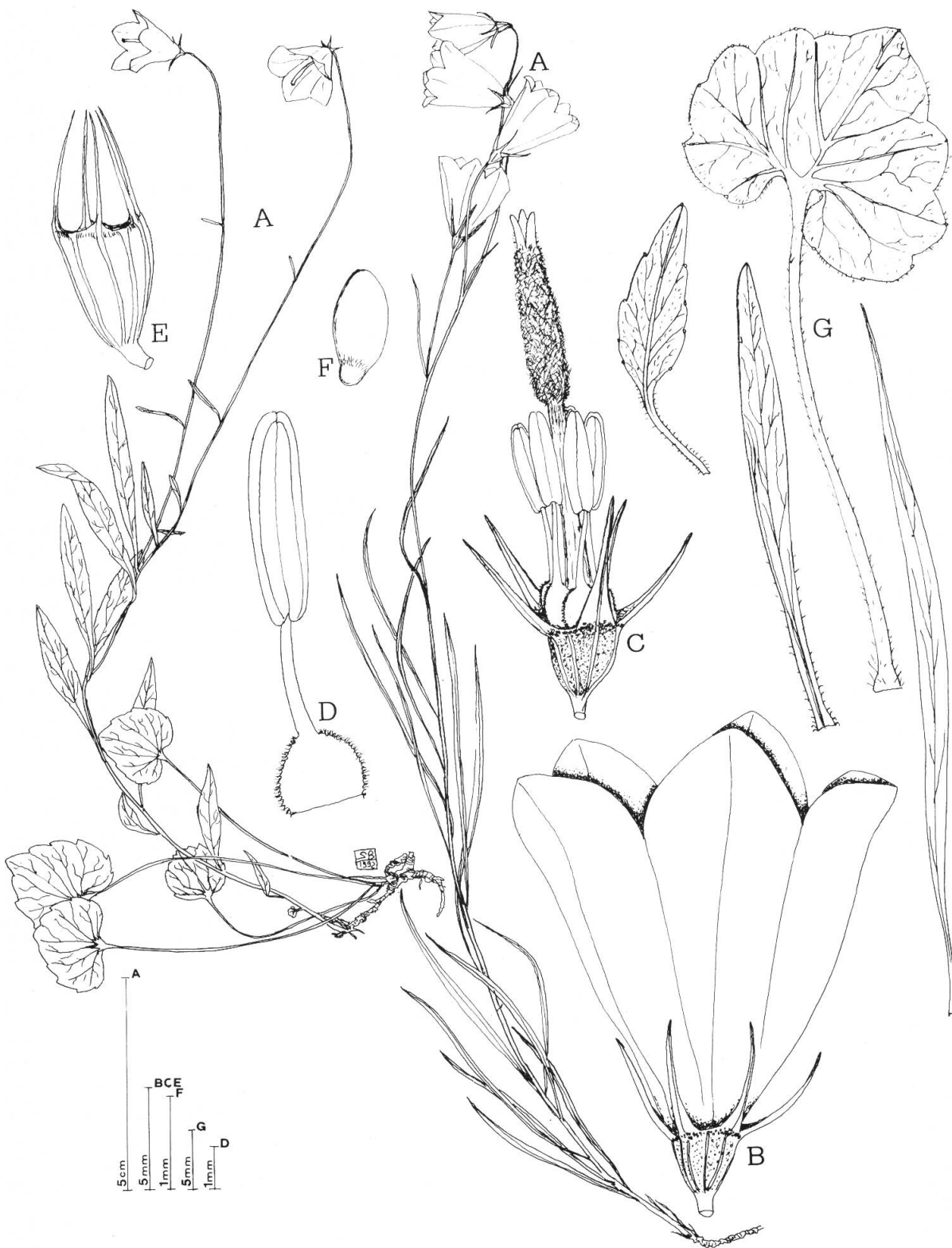
Fig. 1. — Campanula marcenoi Brullo (from type locality). A, habit; B, flower; C, flower without corolla; D, stamen; E, capsule; F, seed; G, leaves.