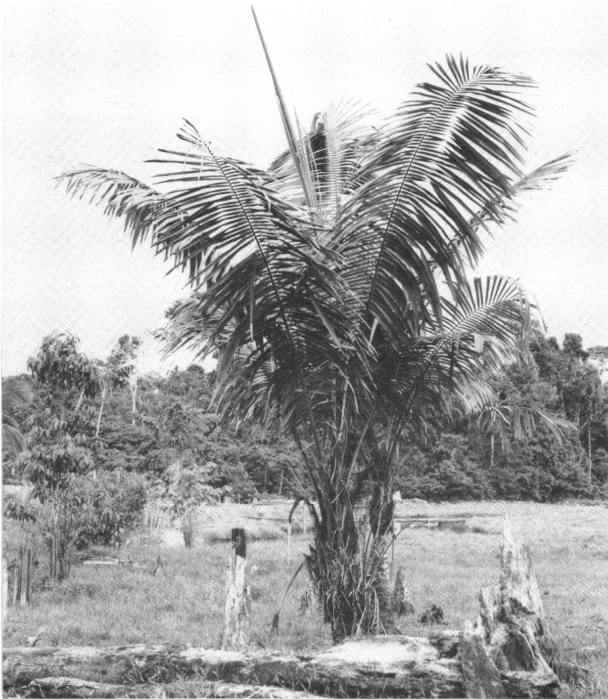
Fig. 2. — Astrocaryum faranae in the field (Photo F. Kahn).