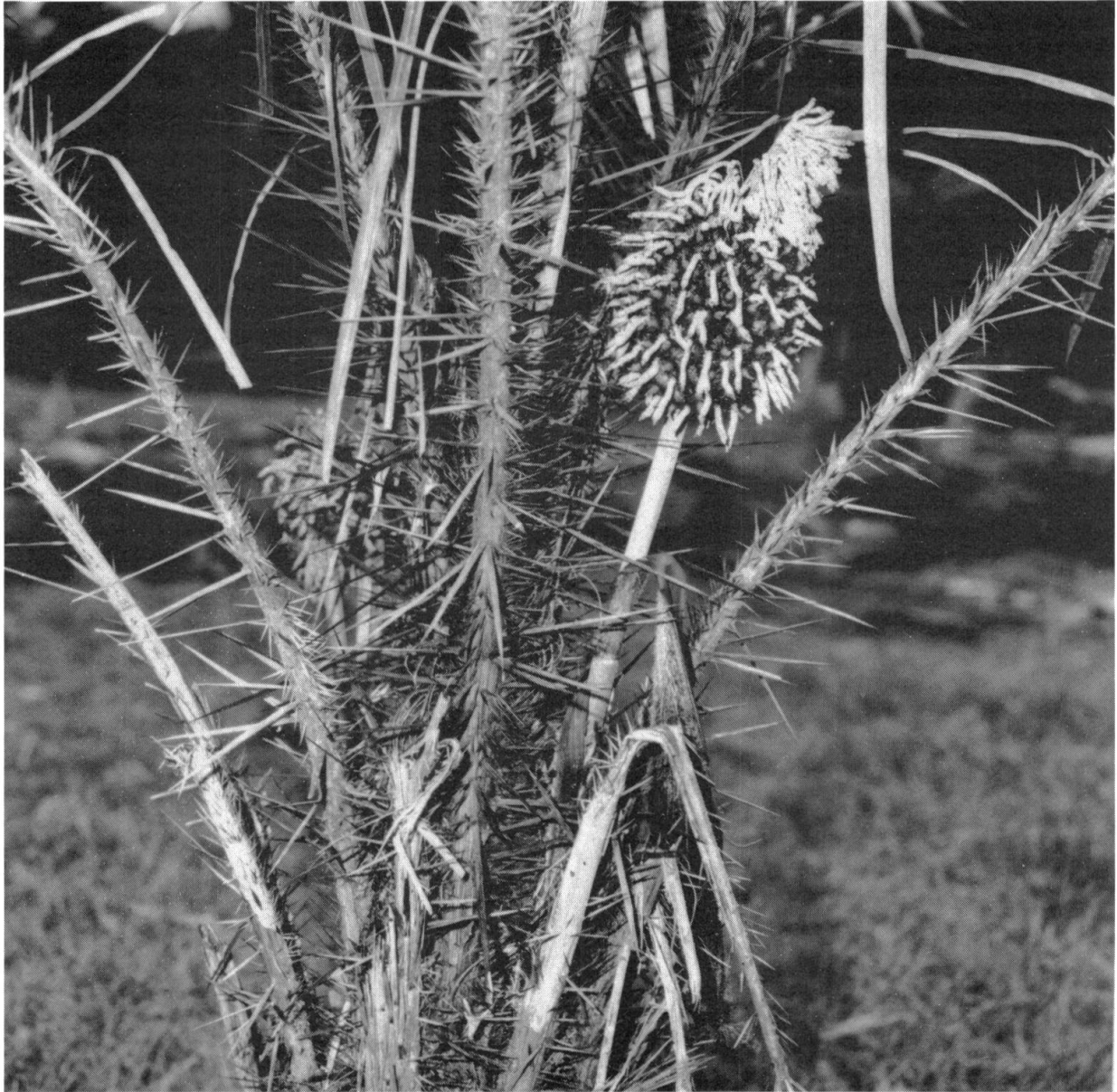
Fig. 3. — Inflorescence of Astrocaryum faranae.