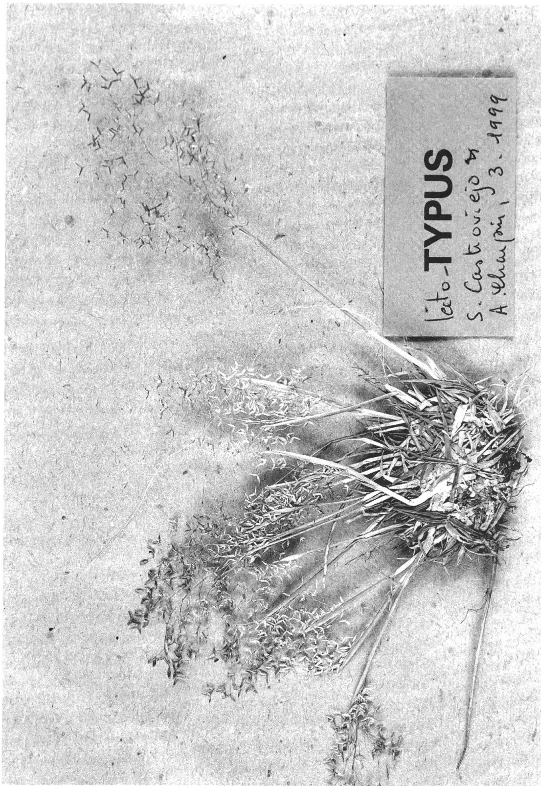
Fig. 2. – Lectotype of Agrostis durieui Gand.