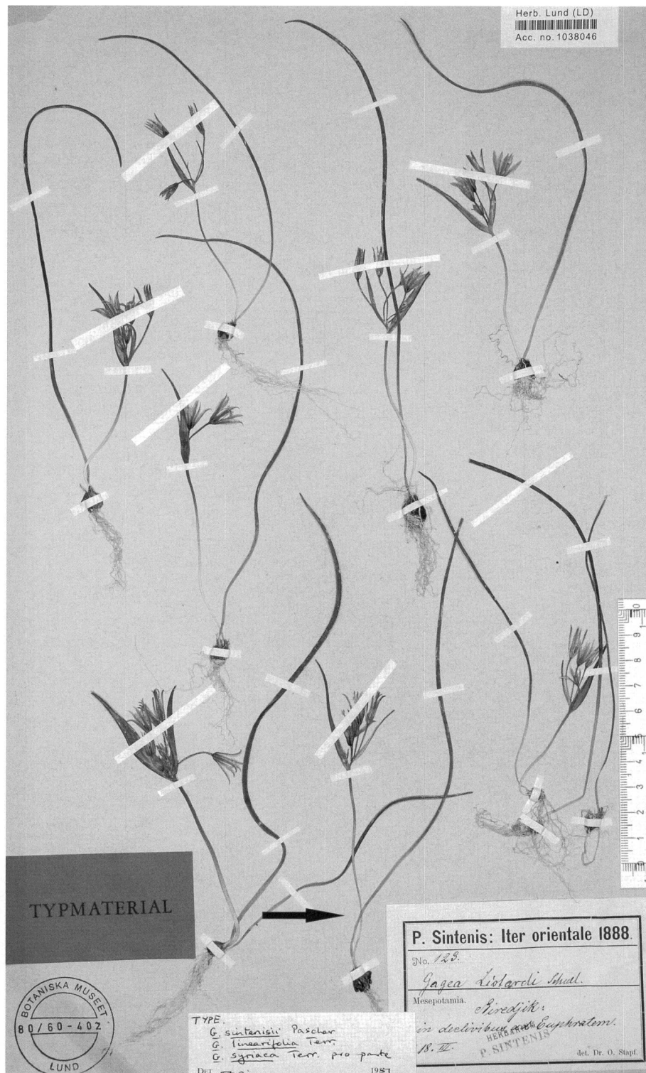
Fig. 3. – Lectotypus of the name Gagea linearifolia A. Terracc. [Sintenis 123, LD]