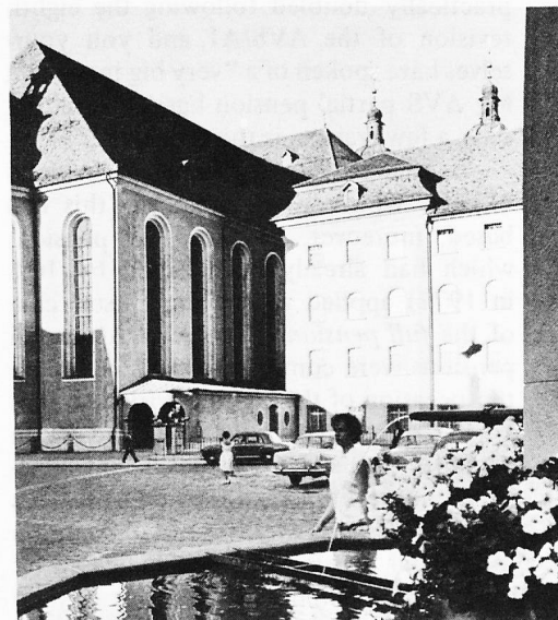
Gallus Square in St. Gall