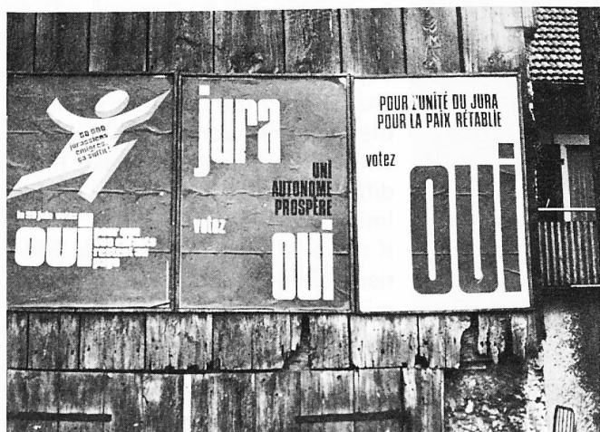
Posters galore ...