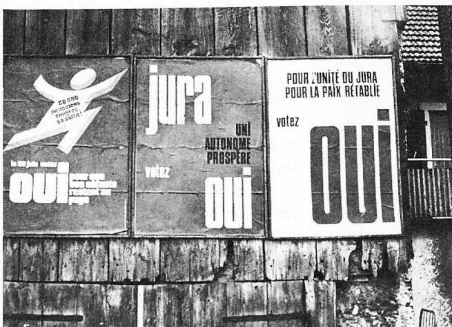
Posters galore ...