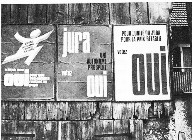
Posters galore ...