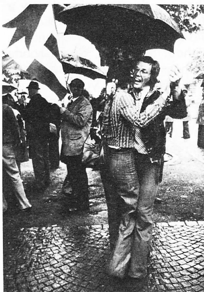
Everyone has his own way of showing pleasure

to the political parties to use all their influence to prevent irreparable damage. The «RJ» recommends to the South a definite no, regarding their adherence to Berne and at the same time speaks in favour of Jura unity. Not so the anti-separatists. Some remain loyal at any price, whilst others still weigh up for and against, i.e. remaining a minority in the Bernese or a majority in the Jura State. The Bernese Government puts its cards on the table: «Since the North will constitute a 23rd Canton in any case, the Jura's special autonomous status within the Cantonal Constitution is now out of the question.» In this respect at least, the situation has been clarified. The Laufental has additional possibilities to determine its future on its own.