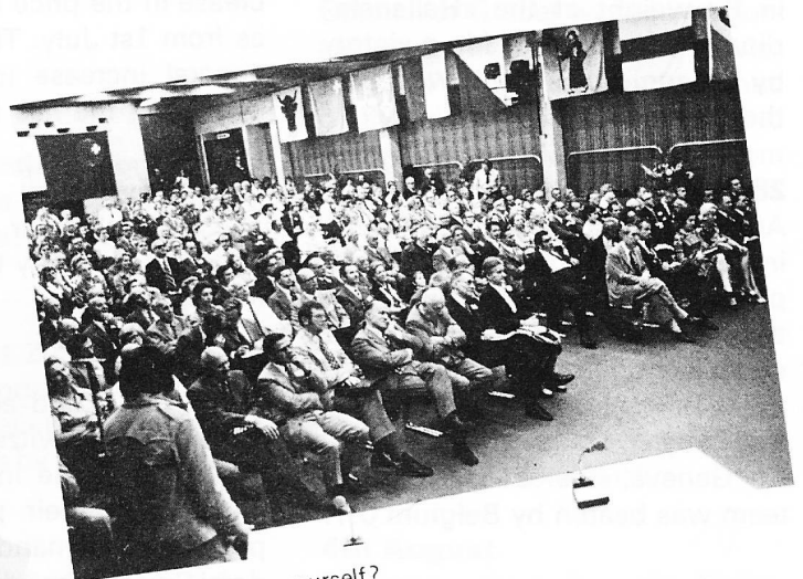
Can you recognise yourself?