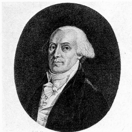
Mr Louis d'Affry, Landammann