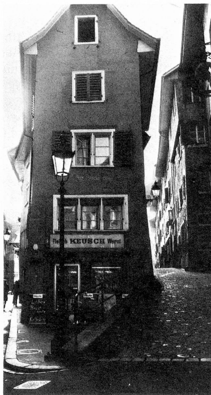
In the old quarter of Baden (ONST Zürich)

This satisfaction with one given feather is typical of the Argovian people. The pars pro toto law is inherent in us. It allows us latitude and the freedom of renunciation. No other freedom exists. It is perhaps the reason for our restraint, the melancholy key-note of our character, which resounds in every piece of art, be it a poem, a picture or a musical composition. It is dangerous, however, to generalise and to talk about «us» and «our character», all the more so as the Canton of Aargau is given the label now and then of «Switzerland in miniature», not only by linguists, geographers and sociologists, but also by politicians, for normally plebiscite results of the Canton of Aargau reflect those of the whole of Switzerland. Yet it is true that certain characteristics are common to all Argovian people. There is no cantonal centre. They lack Paris to indicate fashion trends; they have no Mecca for their daily prayers. They are content with their immediate surroundings: