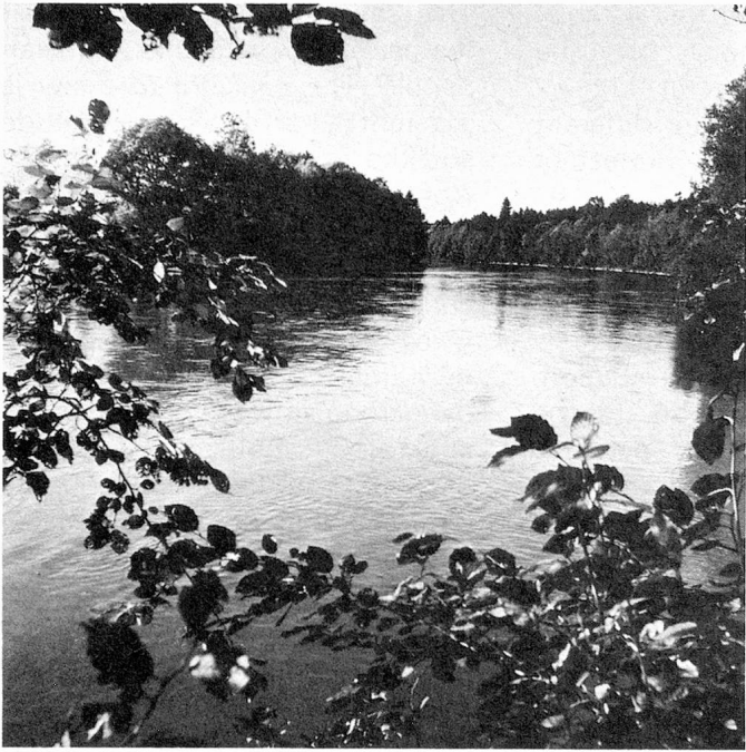
The «Reuss» near Unterlunkofen