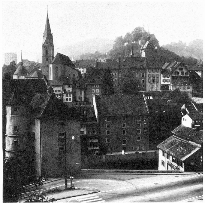
Medieval city of Baden on the edge of the Limmat

Paul Haller, probably our most talented dialect writer (1882–1920), again and again mentions the Jura: