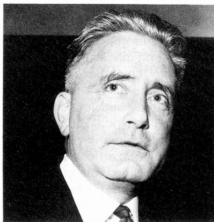
Mr G.-A. Chevallaz, Federal Councillor.

Voting participation in this matter was 39,7 percent. The draft proposal to improve federal finances was rejected by 623 548 yes to