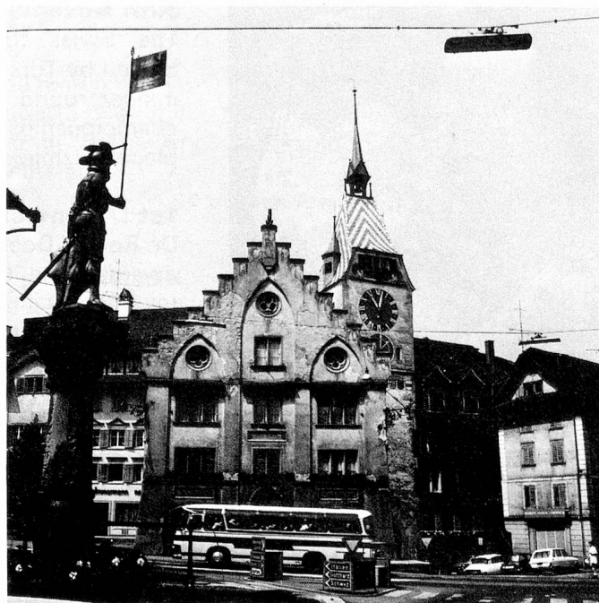
Zoug: square Kolin and its fountain «Linden».