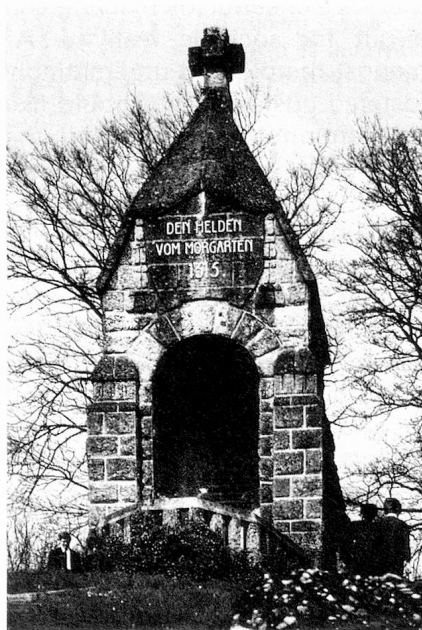
On the lakeside of Aegeri, this monument has been erected in memorial of the Morgarten's battle.

derbund war (1847), the people of Zug stood at the frontier together with the Catholic troops, after their politicians, together with their friends from Basle, had tried in vain to reconcile the fighting men.