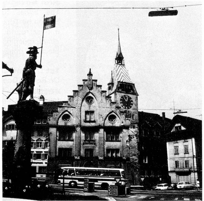
Zoug: square Kolin and its fountain «Linden».