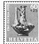
Coloured glass bottle