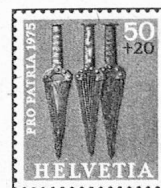
Solid-hilt bronze daggers