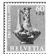
Coloured glass bottle