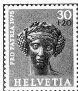
Head of a bronze statuette of Bacchus