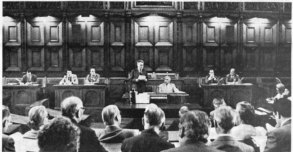
During the session of the Commission of the Swiss abroad.

Official opening of the Assembly – Wildt'sches Haus – lovely surroundings – very pleasant atmo-