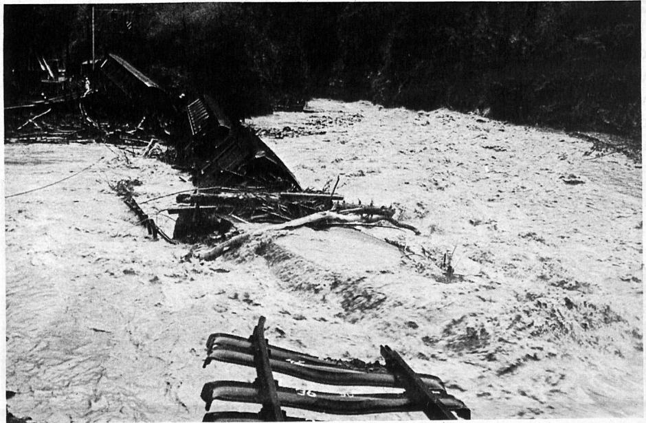
Railway accident near Davos.

fight against the decrease in personal income and the number of jobs. They aimed at preventing the production capacity of the building industry from falling to a lower level, and, in the long run, at regulating unemployment insurance and at adjusting the guarantee against export risks.