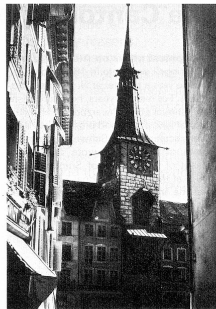
Clock-Tower in Solothurn (SNT0)