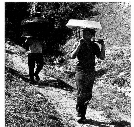
Two «armaillis» of whom the first is carrying his «demoiselle»

At first sight, there seems to be a lack of uniformity. The valley of the Veveyse inclines-almost perilously one might say – over the last hill-sides of the Lavaux, and its inhabitants go down to Vevey both to