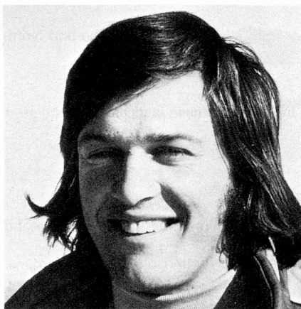
◀ Bernhard Russi, a well-deserved second place in downhill racing.