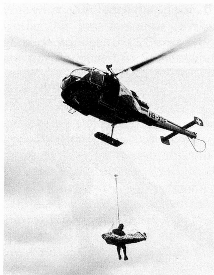
Lifting of a wounded person and his rescuer by means of a winch.