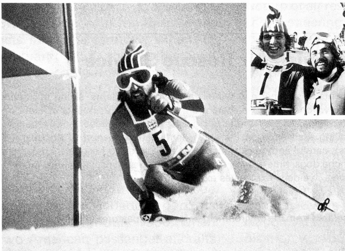
Extraordinary result in the giant slalom: Heini Hemmi and Ernst Good won the gold and silver medals. Hemmi, winner of olympic medal, in action.