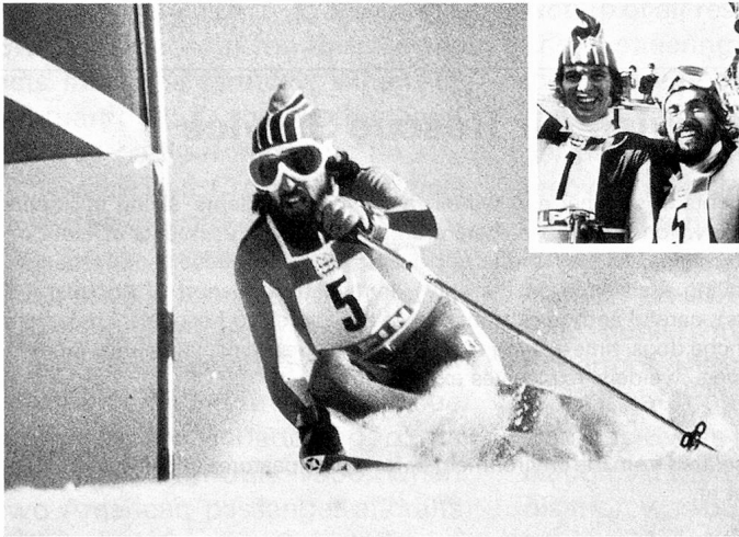
Extraordinary result in the giant slalom: Heini Hemmi and Ernst Good won the gold and silver medals. Hemmi, winner of olympic medal, in action.