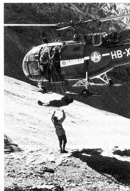
Life-saving in high mountains, loading aboard an Alouette III helicopter by means of a net.