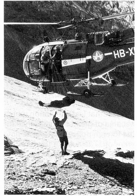
Life-saving in high mountains, loading aboard an Alouette III helicopter by means of a net.