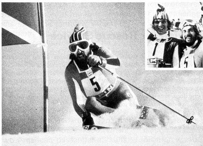
Extraordinary result in the giant slalom: Heini Hemmi and Ernst Good won the gold and silver medals. Hemmi, winner of olympic medal, in action.