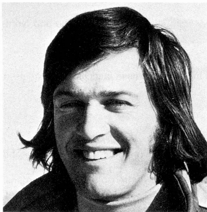
◀ Bernhard Russi, a well-deserved second place in downhill racing.