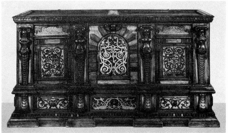
Chest, Renaissance style, Grisons.