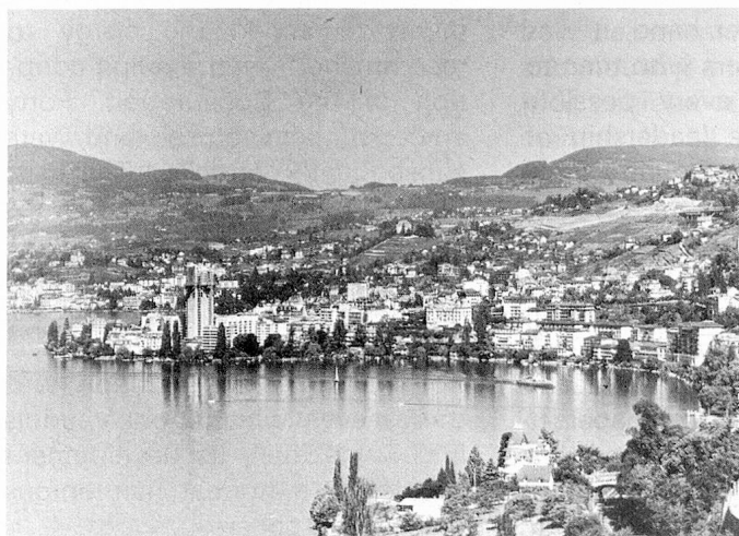
General view of Montreux.