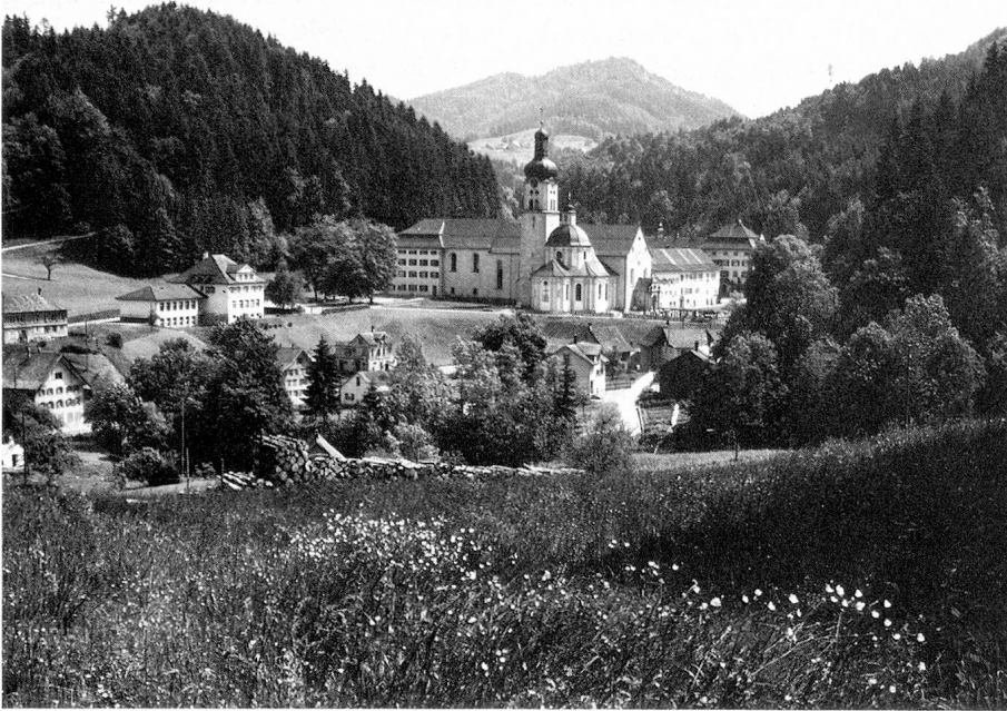
The former Benedictine abbey in Fischingen (photos SNT0)

Untersee for all parts of the world. Amongst the more important industries of the Thur Valley are mills, cardboard, machine and metal ware factories, and a world-wide undertaking which produces emery and abrasive products. The Hinterthurgau in the South, too, has been industrialized more intensively: fairly large concerns in the textile and furniture industries, factories producing kitchen equipment and sunblinds, as well as chemical works are established there. What a colourful variety! In the service sector (banks, insurance, education, hospitals, administration), only 30% of all wage-earners in the Canton are employed, 14% fewer than the Swiss average. The large service industries are concentrated in the neighbouring centres of Zurich, Winterthur, St. Gall, Constance and Schaffhausen. That may be the reason why the average income per head of the Thurgau population lies somewhat below the Swiss average.