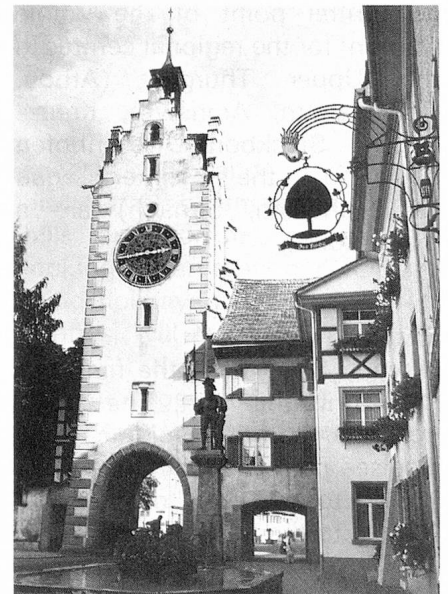
Typical clock – or seal-tower built in 1545 at Diessenhofen

In the Thurgau, too, democracy grows from below. As only Canton in Switzerland, it has preserved the Helvetic Municipal Commune and with it an interesting Commune-dualism. This means that ever since the creation of the Canton in 1803, the duties of the political Commune are divided into two parts, that of the local Commune and the Municipal Commune comprising several local Communes. Both have a dual function; they are independent, solve their own tasks, and on the other hand, they are administrative centres of the Canton, especially the larger, the Municipal Commune. This results in the fact that many citizens hold political offices and thus share in decision-making and responsibility. There is a lively interest in public affairs. In addition, there are the educational Commune supervised by the Education Department, the Church communities of both