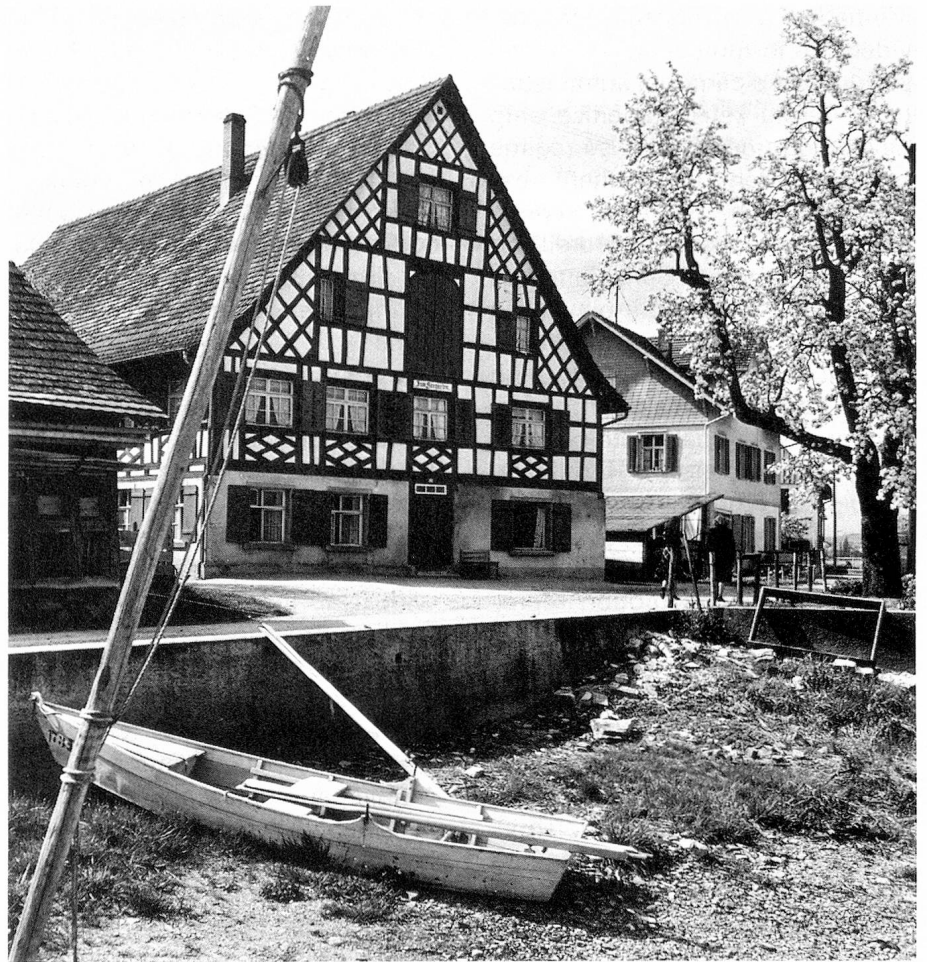
Home with typical frame and fill work architecture in Ermatingen

Already 2800 B.C., the first men settled in this part. The marsh settlements of the neolithic age at Egelsee near Niederwil and Breitenloo to the West of Pfyn belonged to the Pfyn Culture. These people of neolithic times, who were tillers and cattle breeders, were followed in turn by immigrants of various kinds, as the string potters in about 1800 B.C., traders from the South in the Bronze Age, and the Celts in the Hallstatt period. And then, the sparsely populated country on the Lake of Constance belonged to the Roman Empire for over 400 years: brick-making, masonry, fruit- and wine-growing were introduced; generously constructed trade and military routes connected places like Arbor felix (Arbon), Ad fines (Pfyn) and Tasgaetium (Eschenz) with the Midland network. Roman soldiers settled in the forts. Later, the Alemans immigrated and penetrated the area; they gave the country their language, their style of living and building. The Franconian «Gau» organisation knew a Thurgau for the first time; at the beginning, it comprised a quarter of Switzerland, known as the Pagus Durgaugensis according to a St. Gall document of 744. From the earldom as geographical term evolved a judiciary and administrative district. The earldom titles were vested in the House of Kyburg, and from 1264 onward with their heirs, the Habsburgs. The political unity of the Thurgau is owed to their strict leadership. In 1460, the strong and mighty Confederates incorporated the