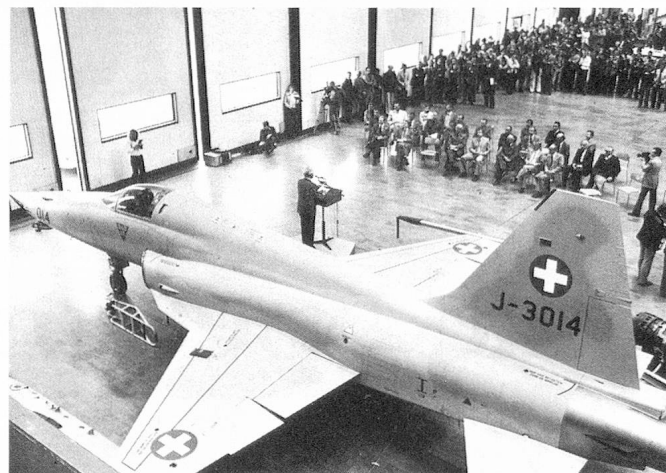
The first fighter planes Northrop F-5 «Tiger» arrived in Switzerland.