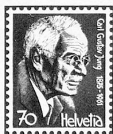
Carl Gustav Jung 1875-1961 Psychologe Psychologue Psicologo