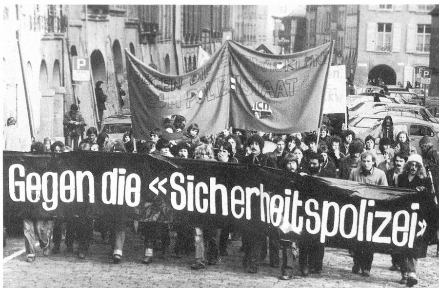
Many differences of opinion were caused by the plebiscite on the formation of a federal security police force. The electorate rejected the proposal.