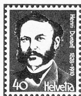
Henri Dunant 1828-1910 Philanthrop Philanthrope Filantropo