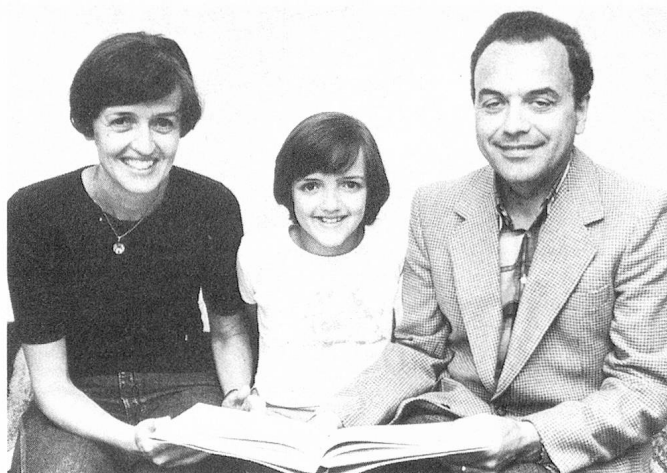
The Basle professor and research scientist Werner Arber received the Nobel Prize for Medicine. He is seen here with his wife and daughter.