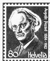
Auguste Piccard 1884-1962 Physiker Physicien Fisico