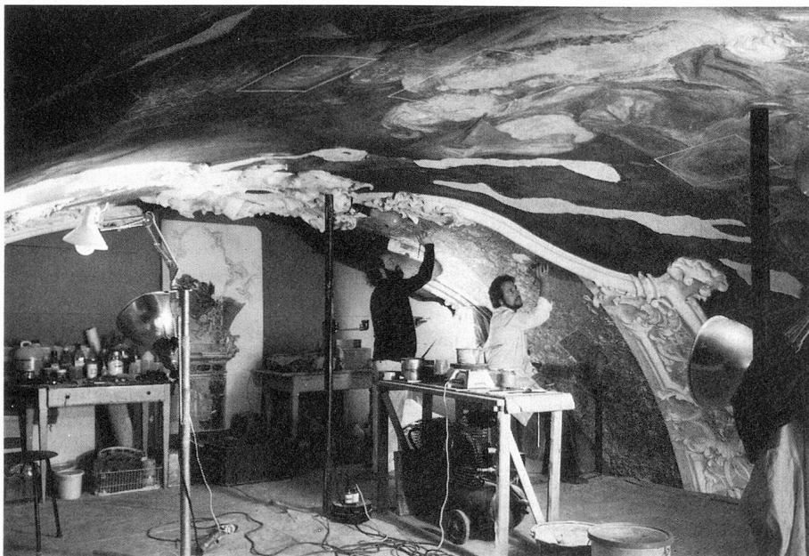
Experts working in the Abbatial of Einsiedeln (SZ)

These are scientific schedules rather than critical assessments, so most cantons are also preparing detailed site inventories which will proceed from an individual study and evaluation of all pre-1920 buildings still in existence to an indication of the special characteristics and importance of architectural complexes and finally of whole sites. As most of these inventories will not be completed for several years, the Confederation decided in 1973 to set up an Inventory of Sites in Switzerland deserving Protection , which is based on the site as a unity and, taking account of the surroundings and views, lays down pro-