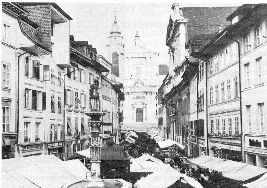
Restaurated Market place of Solothurn.

the original materials are still available in Switzerland or in neighbouring countries, but they are often appreciably dearer than comparable modern materials or take longer to prepare, which adds to the cost.