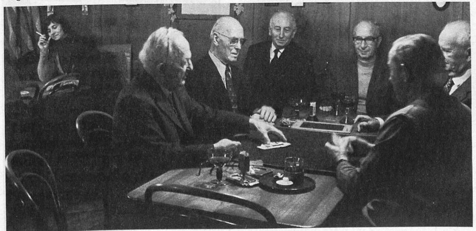
A game of Jass

Finally mention should be made of some important auxiliary organizations in Switzerland which will never fail in advising Swiss abroad; among them are Pro Infirmitas, Pro Senectute, the Swiss Association for the Blind and Visually Handicapped, and the Society for Rheumatic Diseases.