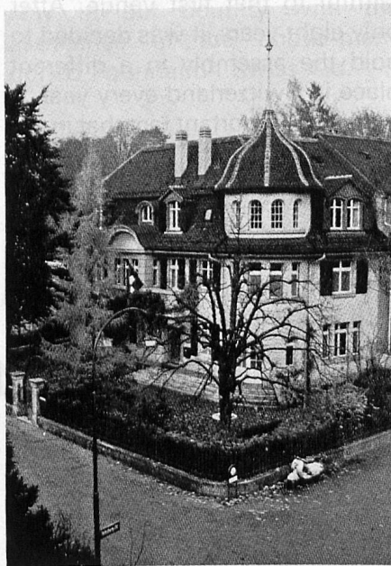
Seat of the Secretariat of the Swiss Abroad

this end, the Secretariat of the Swiss Abroad was established in 1919. It proved, right from the beginning, a most necessary and effective instrument. The need of such a central office was shown for the first time in a concrete way when the returning emigrants from revolutionary Russia had to be looked after.