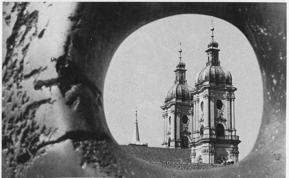
View of St Gall Cathedral

In a similar light the question of jurisdiction must be seen. The applicable law need not necessarily be the one of the place where probate is granted. Many countries may assume jurisdiction over the estate of a Swiss citizen resident there, but apply Swiss law in questions of legal succession and validity of last dispositions (testament, agreement regarding inheritance).