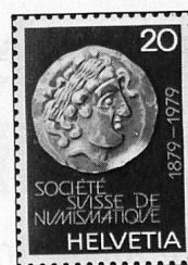
20 c. Centenary of Swiss Numismatic Society