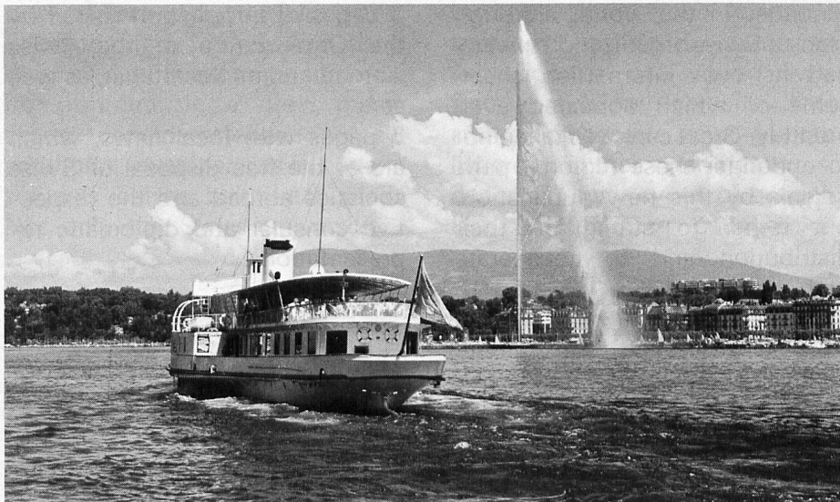
The jet fountain in Geneva, 140 m high