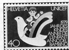
40 c. UN Year of the Child