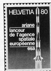
80 c. European Space Agency