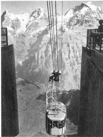
View from the Schilthorn: Eiger, Moench and Jungfrau

in compensation for Vaud and Unteraargau, it again became a bilingual Canton, but, and that was quite new, the two denominations obtained parity. Naturally, in the course of this transformation, the people of the Jura were not asked for their opinion. Only recently were they given an opportunity of voting whether they wished to continue to belong to the Canton of Berne. As a result of several plebiscites, the French-speaking and Catholic northern Jura has now become a new Canton, the southern border of which runs along a historical line of demarcation largely determined by the mediaeval alliances of Berne and Bienne and the southern Jura.