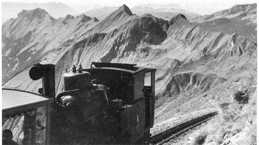
The rack-railway to the Brienzer Rothorn, operational since 1892

With a per capita income of a little over Fr. 18000.— as compared to the Swiss average of approximately Fr. 20000.—, the Canton of Berne belongs to the economically less favoured Cantons of Switzerland. The process of restructuring in the watch industry has caused considerable problems in the Bernese Jura. The high rate of exchange of the Swiss Franc also causes worries to the tourist industry, for the Canton of Berne (after the Grisons) has available the second-largest number of hotel beds. The future of the Bernese economy need, however, not be judged too pessimistically. Thanks to its central position and the newly constructed network of national motorways, the Canton of Berne is easily accessible. The projected improvement of the Loetschberg line by making it double-track will also contribute towards enhancing the Canton's attraction for business undertakings. Local planning in the Communes, now largely completed, and ecological development concepts for the various regions will create a well-balanced structure which is in keeping with the needs of the economy