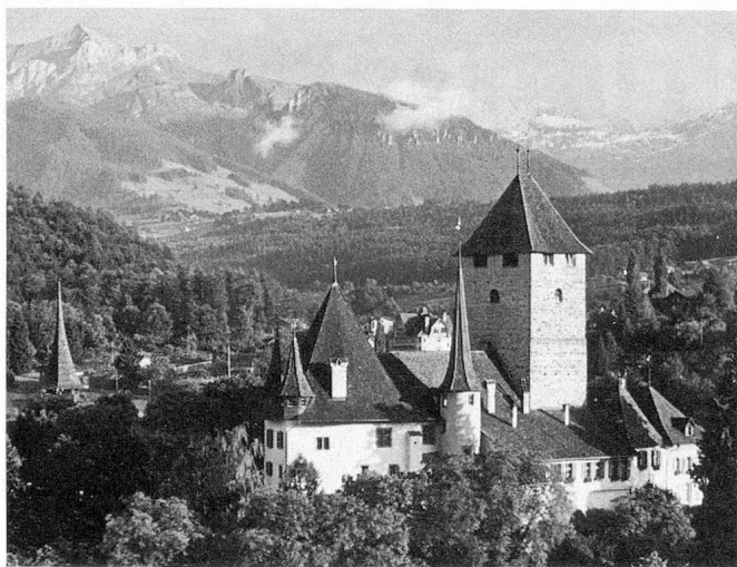
Spiez Castle, seat of the Bubenberg dynasty from 1338–1516