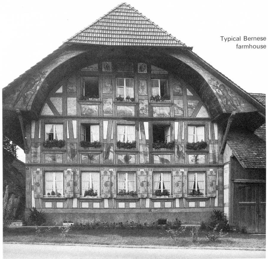
Typical Bernese farmhouse

types of Swiss landscape: the Jura, the Midlands and the Alps. Whilst French is spoken in the Bernese Jura and Bienne is a positively exemplary bilingual town, it is «Bärndütsch» which is prevalent in the rest of the Canton. But anyone who believes that «Bärndütsch» is a uniform language is greatly mistaken. It is one of the attractions of the Bernese language that there are significant differences from valley to valley, from region to region. The Bernese is proud of his local idiom and cultivates it deliberately. The state educational publishers have recently issued a schoolbook with samples of Bernese. But it needs an expert to judge easily whether a person speaks the dialect of Ins, of Trub, of Schwarzenburg or