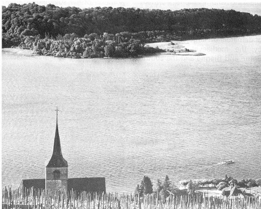
The village of Ligerz with a view of the Isle of St. Peter where Jean-Jacques Rousseau lived in 1765