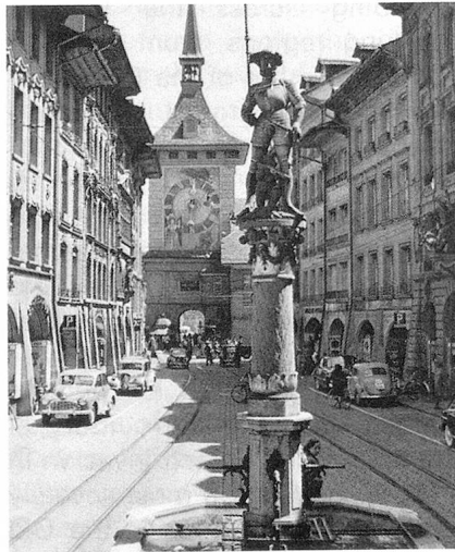
Berne: Marktgasse with the Marksmen's Fountain and the famous Clock Tower

With its 410 Communes divided into 27 administrative districts, the