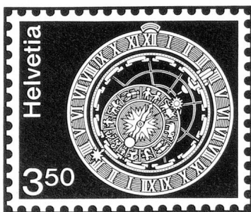
Astronomical clock of Berne clock tower