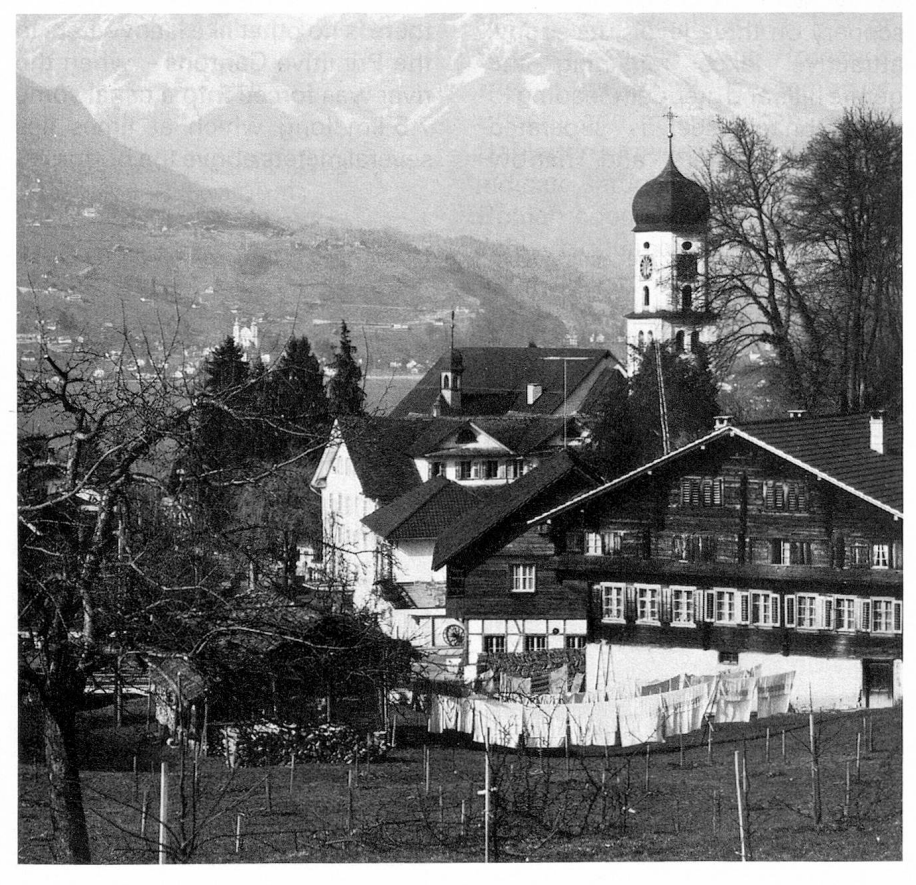
View of Sachseln and the lake of Sarnen

sions of his youth spent at Sachseln, the impressive landscape around the Sarnersee and the people he knew - a beautiful and warm-hearted picture. Yodelling and Betruf have always been part of musical life, and folk music is widely cultivated. Many Obwalden writers, composers of popular and modern music, painters and sculptors are known well beyond the boundaries of the Canton. Such culture needs great care, just like the countryside, for the two are intertwined. There exists earnest endeavour to protect and enrich the landscape: protection by segregating building land from open meadows and woods, and by re-introducing the lynx.