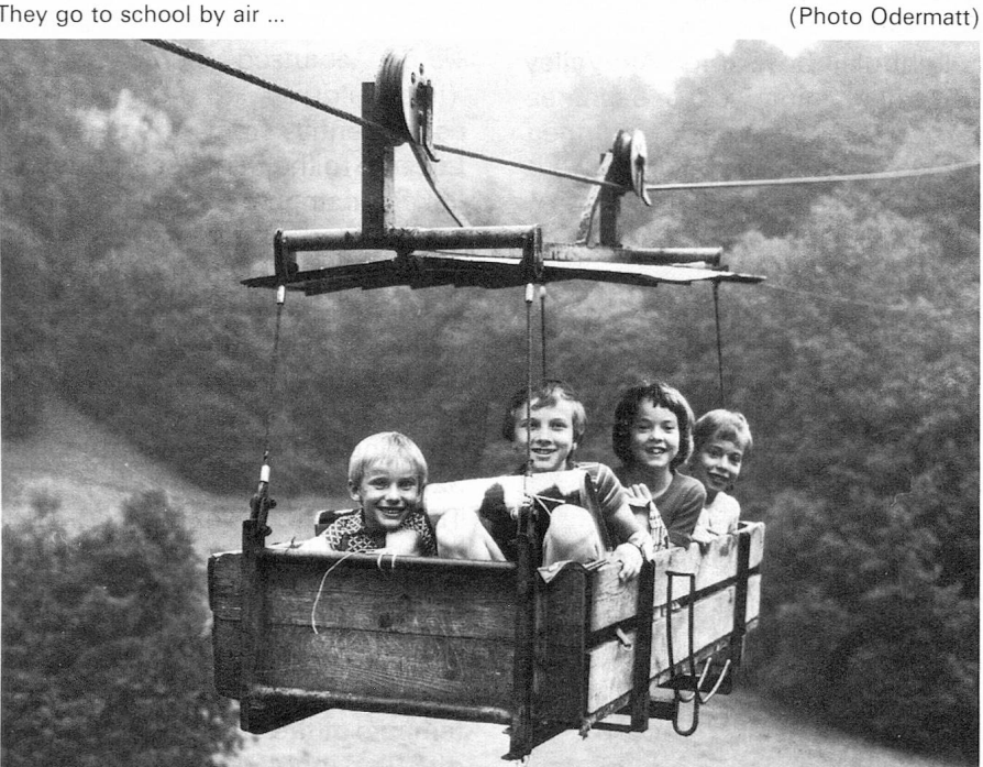
They go to school by air ...

tradition. The Library of the Engelberg Monastery houses a considerable treasury from the golden age of illuminated manuscripts (12th century) and a rich collection of medieval art treasures. One of the artists and authors of our times should be mentioned. Heinrich Federer who lived from 1866 to 1928. His works reflect the impres-