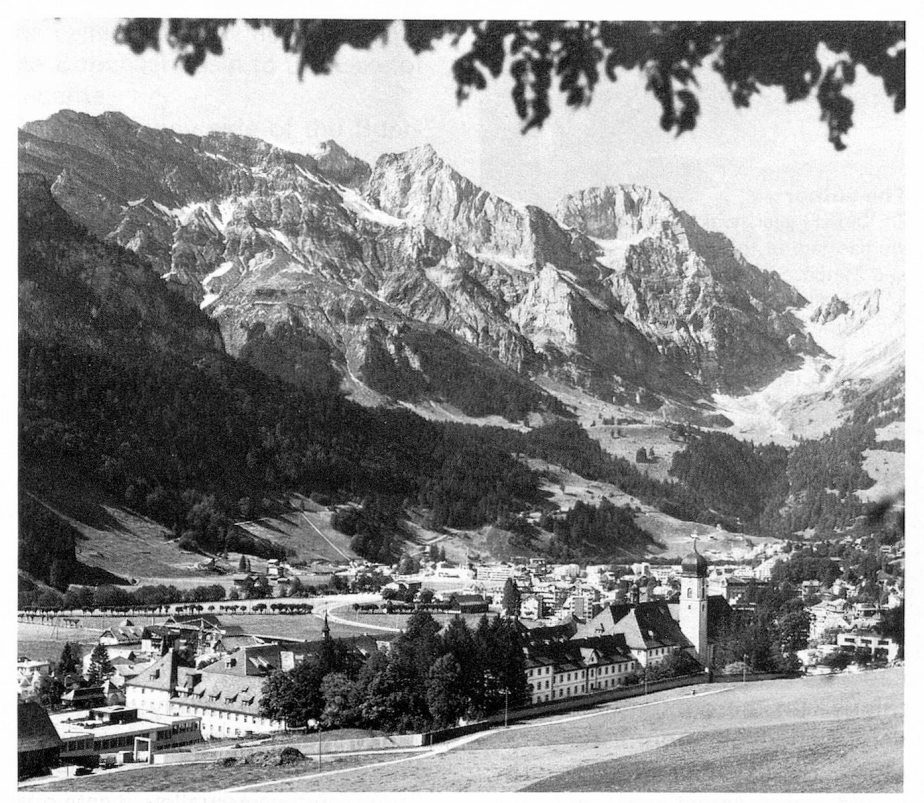
The Benedictine Abbey of Engelberg, founded in 1120.