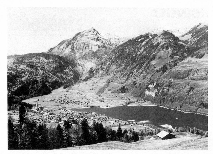
Lungern and its lake