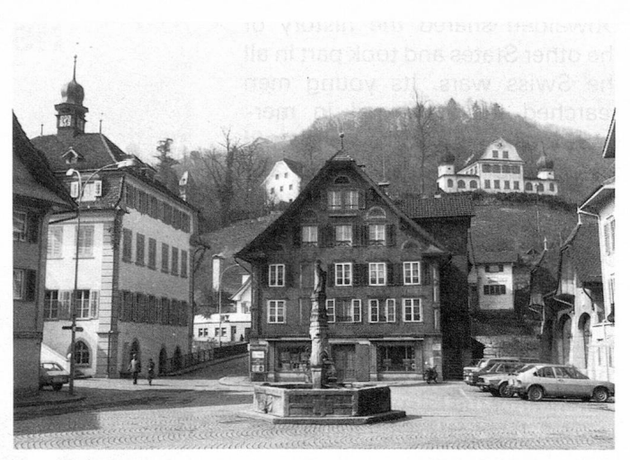
A square in the old Sarnen; on the left the town hall; the old shooting stand on the Landenberg hill.