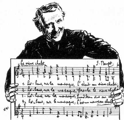
Abbé Joseph Bovet 1879-1951

Saturday, 23rd and Sunday, 24th August: Day of the Fribourgeois from inside Switzerland and abroad at «Grün 80», Swiss exhibition on horticulture and landscaping, covering 46 ha.