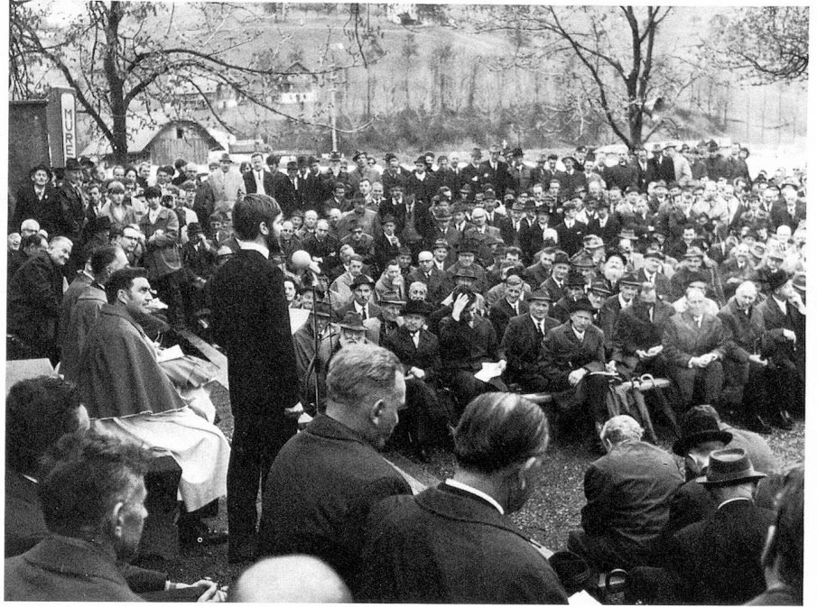
Swiss Landsgemeinde in Stans

from the Bronze Age until it was destroyed by military installations. May Nidwalden bear the key of St. Peter and the proud Romanus sum in its crest? Fire tombs at Buochs and meadow names like Dabletten, Kirsiten and Brattelen indicate settlements in the Celto-Roman epoch. But the unmistakable language is Alemannic. Speedily and as on wings, the cumbersome vowels and umlauts of Northern idioms glide into diphthongs so difficult to imitate, preferably in clear «e»s and «i»s. The easiest way of recognizing the Nidwaldner, however, is the cheerful «ili» which he adds to all persons and things that he likes: Maitili, Tädili, Schätzili, Huisili, Chälbili . But of whatever stock he may come, he must be alert, quick to make decisions, versatile and inventive – that is what nature asks of him.