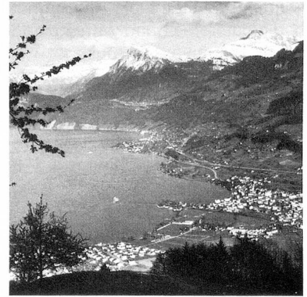
View of the Buochserbucht facing Beckenried. In the background the mountains Nieder- and Oberbauen.

Thus remained only consultation with Ennetbirgen and sharing of its political fate. Together with Uri and Schwyz, Nidwalden reigned in Bellenz, Blenio and Riviera for well nigh 400 years, after Obwalden had retired following some unhappy and disappointing undertakings. Not even the tribally related Haslital could unite with it. Who knows, if Nidwaldner had inhabited the upper valley ... Yet in Swiss political life, Nid-