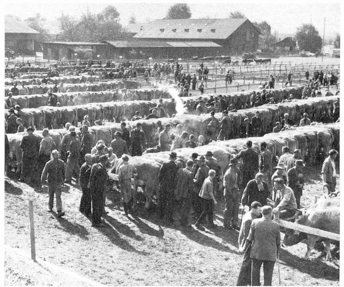
Animal market in Wil

What may be said about the modern method of governing the Canton? Nidwalden is one of the Landsgemeinde Cantons. Every year, on the last Sunday in April, the people assemble at Wil on the Aa, in order to vote on matters of importance and to conduct elections. The citizens are greeted as « getriiwi, liebi Landsliit ». But the complexity of more and more legislation is becoming too much of a burden. This has led to an oligarchy of a group of leaders dominating the Cantonal Parliament. In addition, one has to watch that the Landsgemeinde does not become a mere folkloristic event.