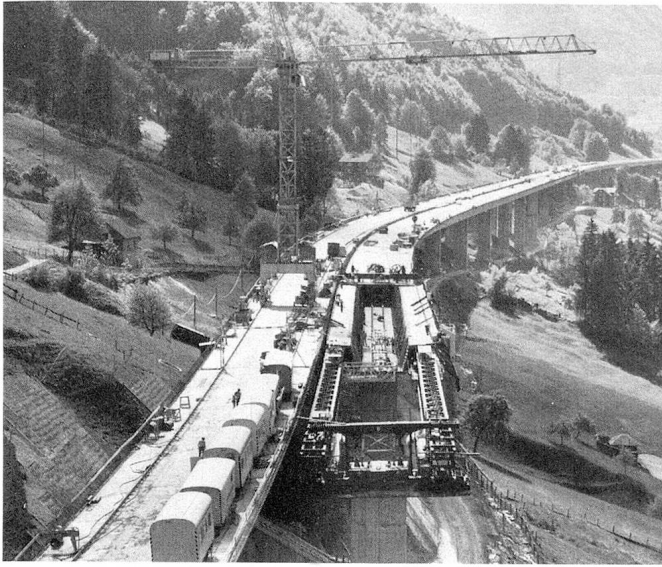
Construction of a viaduct between Beckenried and Rüteneu