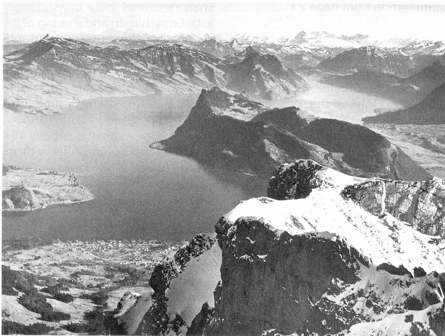
View of the Bürgenstock and the lake of Lucerne

walden had little luck. Although it had created the bond with the two other Primitive Cantons, it was soon outdone by the more densely populated and cautious Obwalden. Within the framework of the Diet, Nidwalden counted only as one third of the votes. Once only in three years, it was allowed to send representatives to the Diet and provide bailiffs for the communal bailiwicks. Nidwalden protested immediately against this rebuff, in Council and with force, in the unhappy French period, by rejecting Engelberg so ready to join, and also during the Sonderbund wars. If its Government today insists so firmly on a full voice in the Council of States, inspite of general federal interests, it has its source in history.