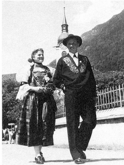
Traditional costume of the canton Nidwalden