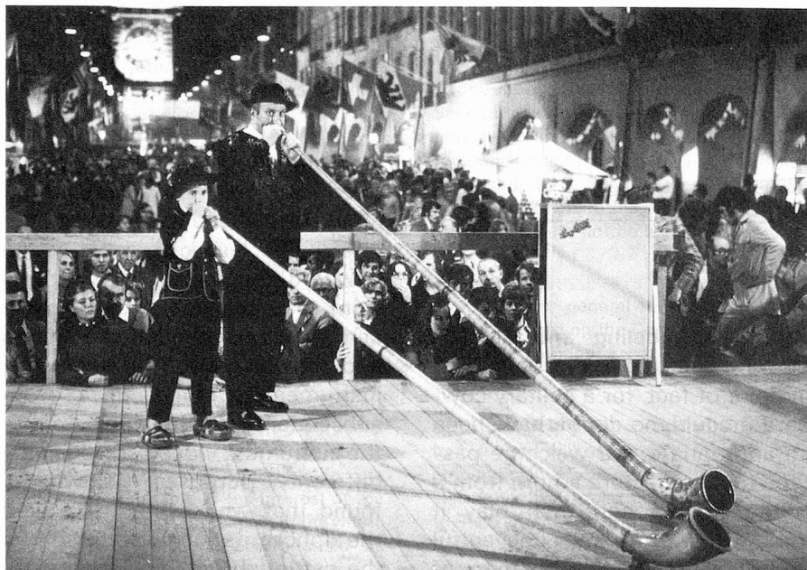
During the 50th. Congress, Berne 1972.