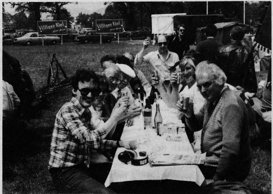
S.R.A. Team at the TIR Federal Luzern.

Pistol shooting is also held at Bisley and on 31st October and 12th December at the elite Marylebone Pistol Club in the City of London.