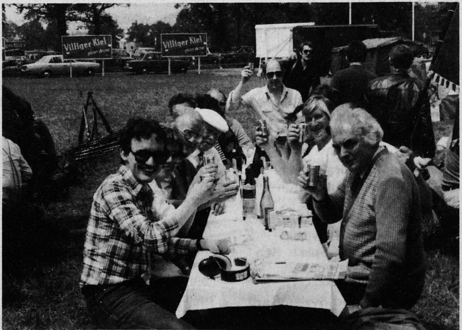
S.R.A. Team at the TIR Federal Luzern.

Pistol shooting is also held at Bisley and on 31st October and 12th December at the elite Marylebone Pistol Club in the City of London.