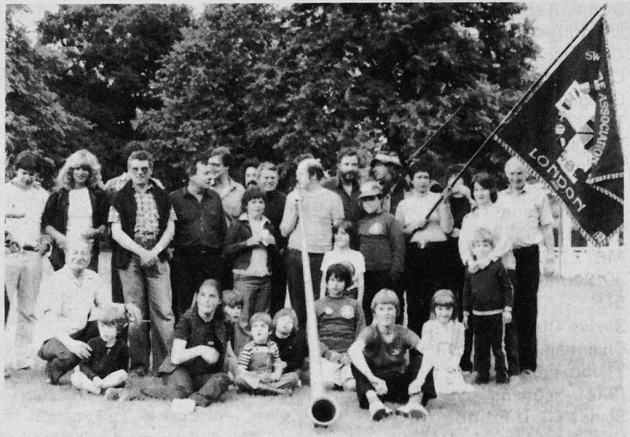
End of season meeting at Bisley 1981.

6th June 27th June 5th September 19th September 17th October