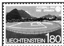
Special stamps «Football World Championship 1982 Spain»