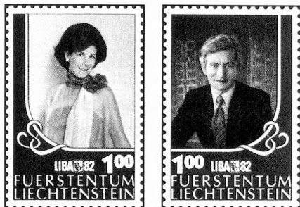
Special stamps «LIBA '82»