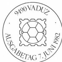
Special stamps «Football World Championship 1982 Spain»